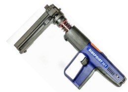
.27 CAL AUTO / POWER ADJ.