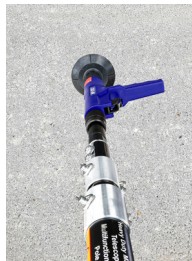
Overhead Hanging Applications

* Lightest Weight Powder Actuated Ceiling Tool in the Market