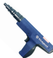
.27 CAL SEMI-AUTOMATIC