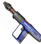
.27 CAL AUTO / POWER ADJ.