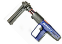
.27 CAL AUTO / POWER ADJ.